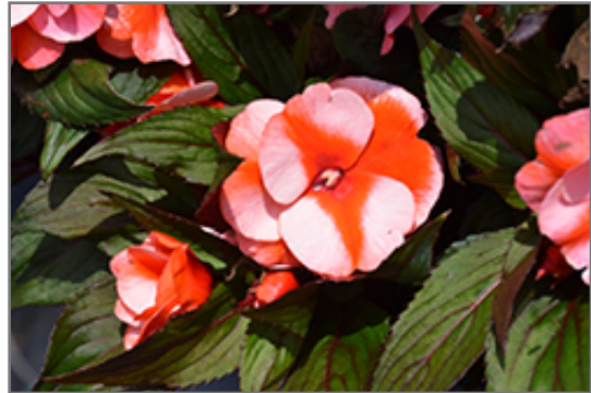
Petticoat Orange Star New Guinea Impatiens flowers

Petticoat Orange Star New Guinea Impatiens is recommended for the following landscape applications;