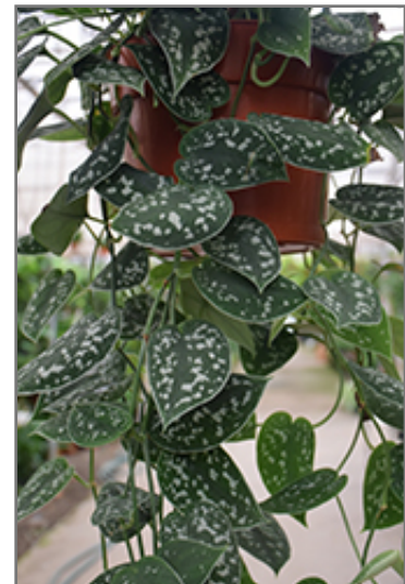
Argyraeus Pothos foliage