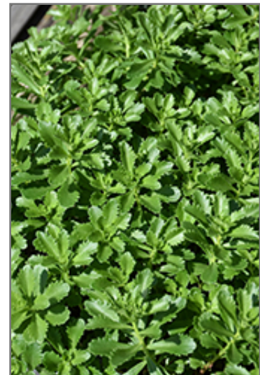
Japanese Stonecrop