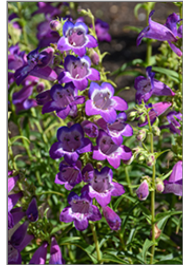
Cha Cha Purple Beard Tongue flowers

Cha Cha Purple Beard Tongue is recommended for the following landscape applications;