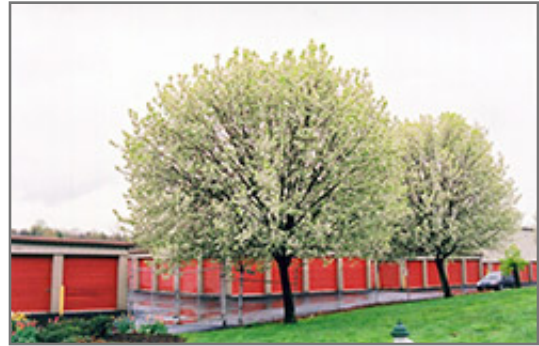
Bradford Ornamental Pear in bloom