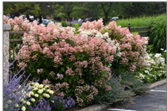
Quick Fire Hydrangea in bloom