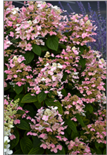
Quick Fire Hydrangea flowers