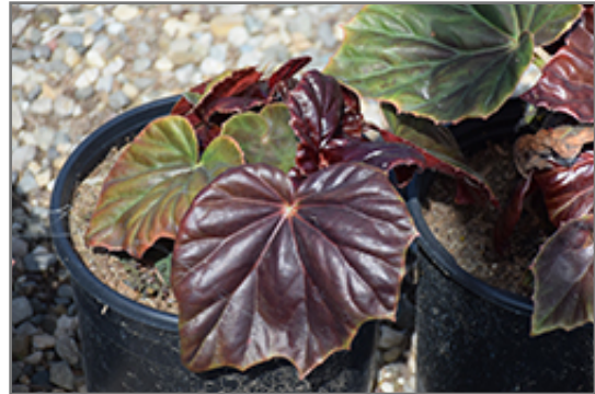
Red Fred Begonia foliage

This is a high maintenance plant that will require regular care and upkeep, and usually looks its best without pruning, although it will tolerate pruning. Deer don't particularly care for this plant and will usually leave it alone in favor of tastier treats. Gardeners should be aware of the following characteristic(s) that may warrant special consideration;