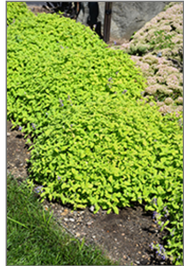
Chartreuse On The Loose Catmint