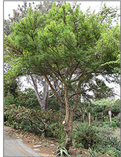
Red Acacia