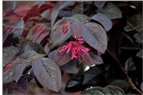
Carolina Midnight Chinese Fringeflower flowers

Carolina Midnight Chinese Fringeflower is recommended for the following landscape applications;