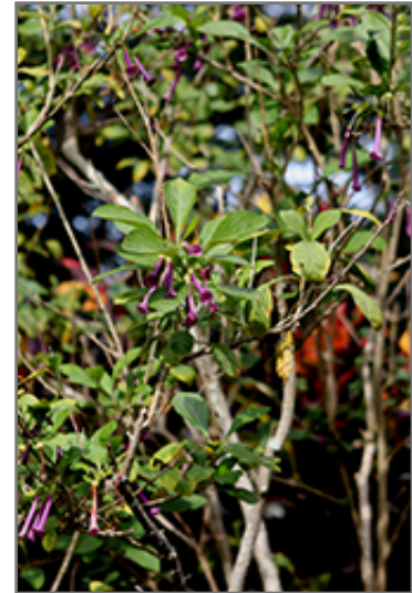
Purple Tube Flower flowers

Purple Tube Flower is recommended for the following landscape applications;