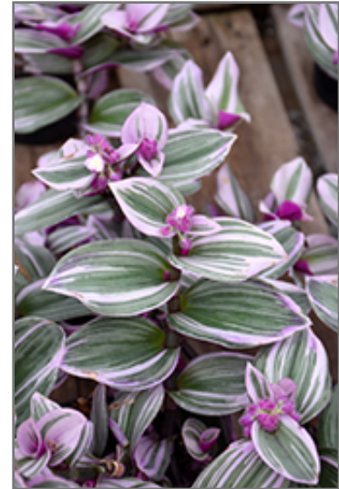
Nanouk Tradescantia foliage

This is an herbaceous evergreen houseplant with a spreading, ground-hugging habit of growth. Its relatively fine texture sets it apart from other indoor plants with less refined foliage. This plant may benefit from an occasional pruning to look its best.