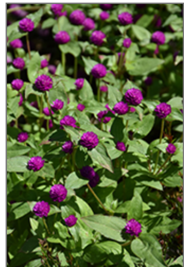
Pinball Purple Globe Amaranth flowers