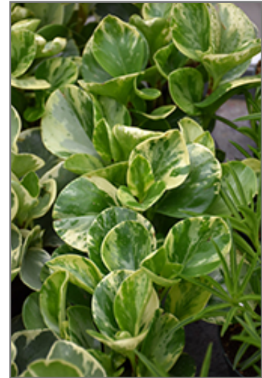
Golden Gate Baby Rubber Plant foliage

Golden Gate Baby Rubber Plant is recommended for the following landscape applications;