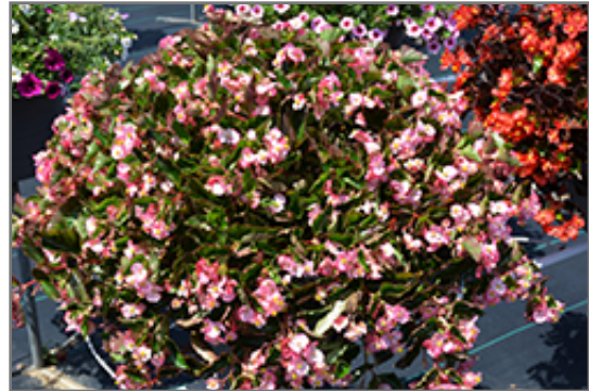
Hula Pink Begonia in bloom

Hula Pink Begonia is a fine choice for the garden, but it is also a good selection for planting in outdoor containers and hanging baskets. Because of its spreading habit of growth, it is ideally suited for use as a 'spiller' in the 'spiller-thriller-filler' container combination; plant it near the edges where it can spill gracefully over the pot. Note that when growing plants in outdoor containers and baskets, they may require more frequent waterings than they would in the yard or garden.