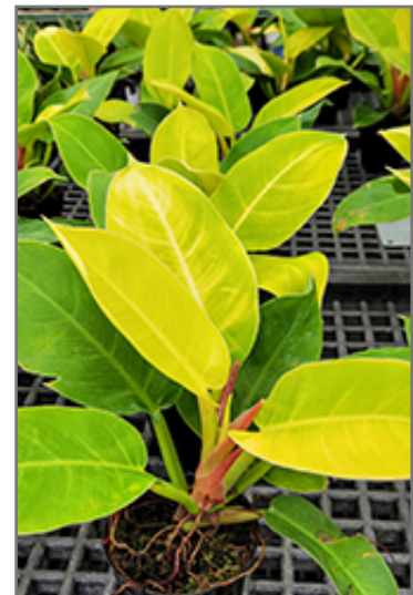
Prismacolor Imperial Gold Philodendron foliage