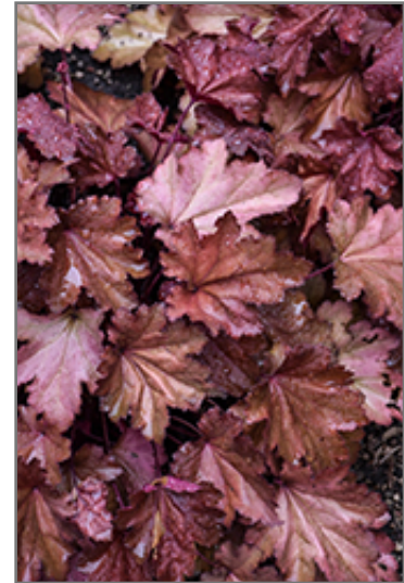
Magma Coral Bells foliage

Magma Coral Bells is recommended for the following landscape applications;