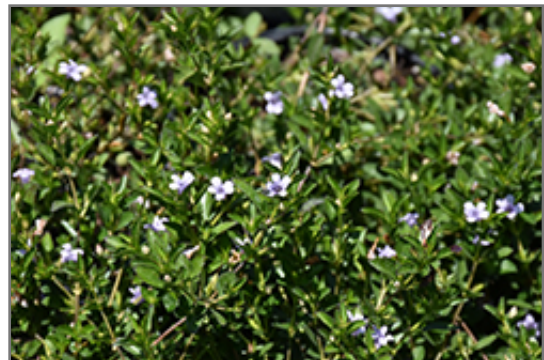
Swamp Twinflower flowers