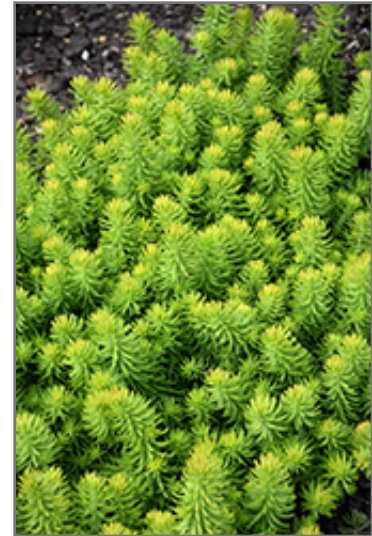
Prima Angelina Stonecrop

Prima Angelina Stonecrop is recommended for the following landscape applications;