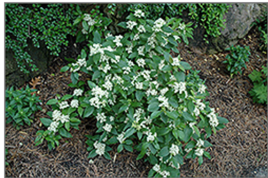
Snow Lace Dogwood in bloom