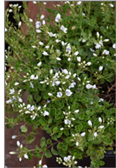
Snowmass Blue-Eyed Veronica flowers

This plant will require occasional maintenance and upkeep, and is best cleaned up in early spring before it resumes active growth for the season. It is a good choice for attracting butterflies to your yard, but is not particularly attractive to deer who tend to leave it alone in favor of tastier treats. It has no significant negative characteristics.