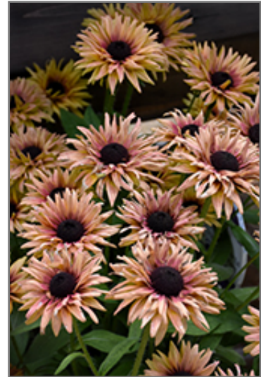
August Flame Coneflower flowers

August Flame Coneflower is recommended for the following landscape applications;