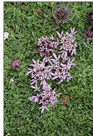
Carpeting Pincushion Flower flowers