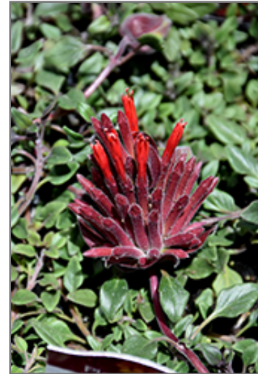
Marian Sampson Scarlet Monardella flowers

This is a relatively low maintenance plant, and should not require much pruning, except when necessary, such as to remove dieback. It is a good choice for attracting hummingbirds to your yard. It has no significant negative characteristics.