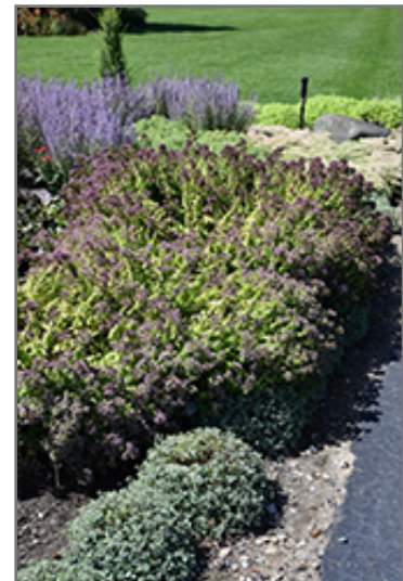
Drops of Jupiter Oregano in bloom