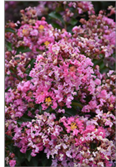
Barista Peppermint Mocha Crapemyrtle flowers

Barista Peppermint Mocha Crapemyrtle is recommended for the following landscape applications;