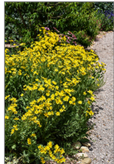
Engelmann's Daisy in bloom