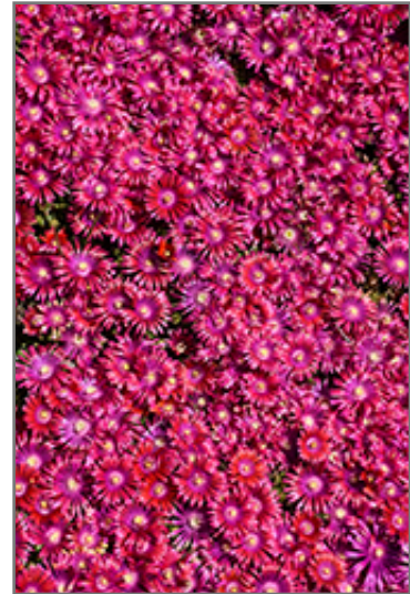
Granita Raspberry Ice Plant in bloom

Granita Raspberry Ice Plant is recommended for the following landscape applications;