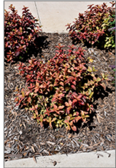
Midnight Sun Reblooming Weigela