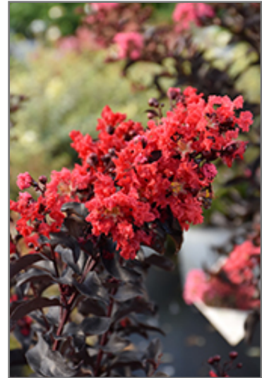
Center Stage Red Crapemyrtle flowers

Center Stage Red Crapemyrtle is recommended for the following landscape applications;