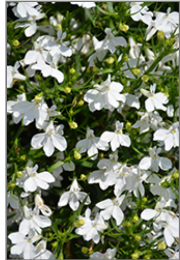
Suntory Trailing White Lobelia flowers

Suntory Trailing White Lobelia is recommended for the following landscape applications;