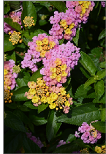
Havana Sunrise Lantana flowers

This is a relatively low maintenance plant, and should not require much pruning, except when necessary, such as to remove dieback. It is a good choice for attracting butterflies and hummingbirds to your yard, but is not particularly attractive to deer who tend to leave it alone in favor of tastier treats. It has no significant negative characteristics.