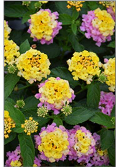
Havana Sunrise Lantana flowers

Havana Sunrise Lantana is a fine choice for the garden, but it is also a good selection for planting in outdoor containers and hanging baskets. It is often used as a 'filler' in the 'spiller-thriller-filler' container combination, providing a mass of flowers against which the thriller plants stand out. Note that when growing plants in outdoor containers and baskets, they may require more frequent waterings than they would in the yard or garden.