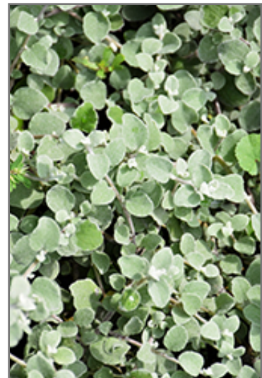
Silver Licorice Plant foliage