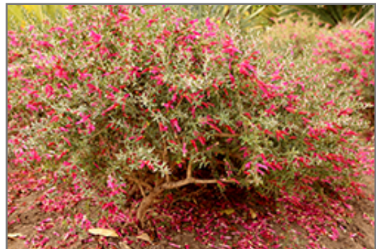
Wendy Spotted Emu Bush in bloom