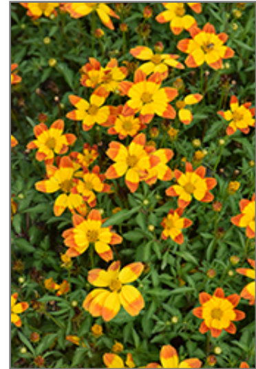
Bidy Boom Red Bidens flowers

Bidy Boom Red Bidens is recommended for the following landscape applications;