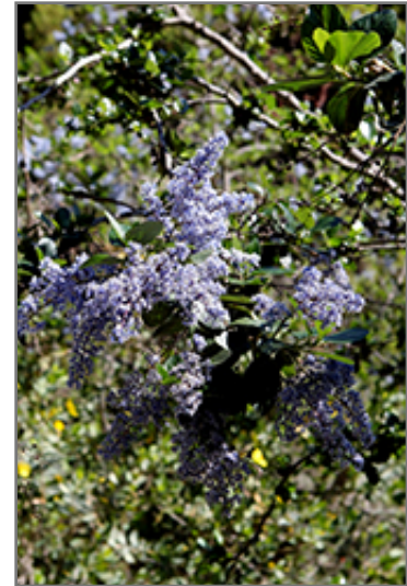
Powder Blue Ceanothus flowers