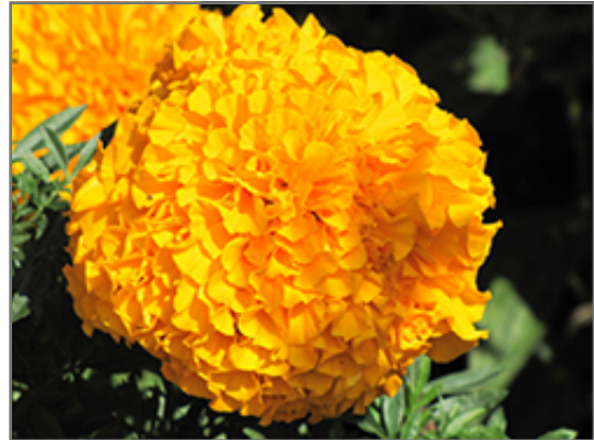
Inca II Orange Marigold flowers

This is a relatively low maintenance plant. Trim off the flower heads after they fade and die to encourage more blooms late into the season. Deer don't particularly care for this plant and will usually leave it alone in favor of tastier treats. It has no significant negative characteristics.