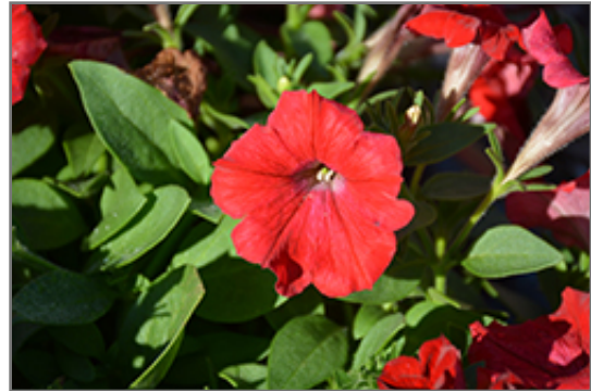
Whispers Red Petunia flowers

This plant will require occasional maintenance and upkeep. Trim off the flower heads after they fade and die to encourage more blooms late into the season. It is a good choice for attracting butterflies and hummingbirds to your yard, but is not particularly attractive to deer who tend to leave it alone in favor of tastier treats. It has no significant negative characteristics.