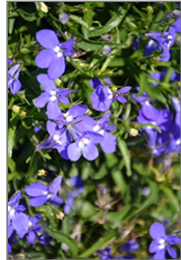
Suntory Compact Blue Lobelia flowers

Suntory Compact Blue Lobelia is recommended for the following landscape applications;