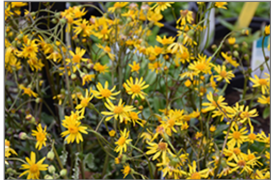
Golden Ragwort flowers

Golden Ragwort is a fine choice for the garden, but it is also a good selection for planting in outdoor pots and containers. With its upright habit of growth, it is best suited for use as a 'thriller' in the 'spiller-thriller-filler' container combination; plant it near the center of the pot, surrounded by smaller plants and those that spill over the edges. Note that when growing plants in outdoor containers and baskets, they may require more frequent waterings than they would in the yard or garden.