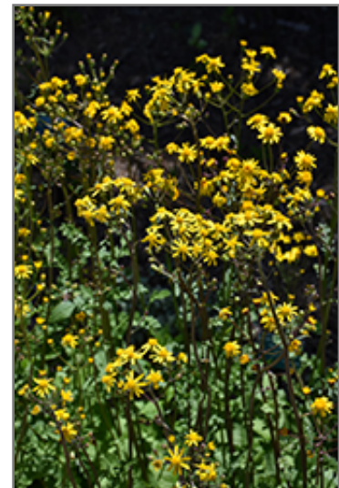
Golden Ragwort flowers