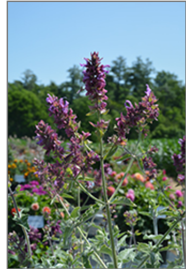
Lancelot Canary Island Sage flowers

Lancelot Canary Island Sage is an herbaceous perennial with an upright spreading habit of growth. Its relatively fine texture sets it apart from other garden plants with less refined foliage.