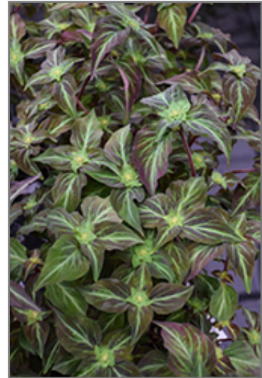
Night Light Moneywort foliage