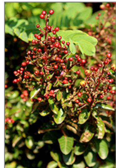
Barista Dark Roast Crapemyrtle flower buds