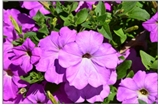
Opera Supreme Lavender Petunia flowers

Opera Supreme Lavender Petunia is recommended for the following landscape applications;