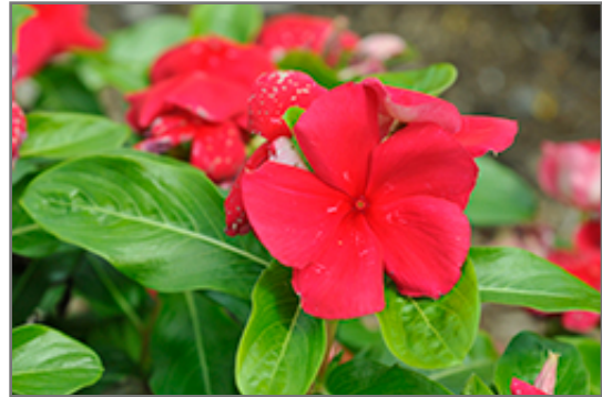
Mega Bloom Dark Red Vinca flowers

This plant will require occasional maintenance and upkeep, and should not require much pruning, except when necessary, such as to remove dieback. It is a good choice for attracting butterflies to your yard, but is not particularly attractive to deer who tend to leave it alone in favor of tastier treats. It has no significant negative characteristics.