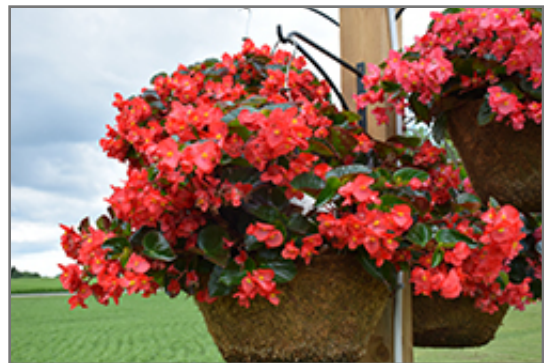
Viking Explorer Red on Green Begonia in bloom