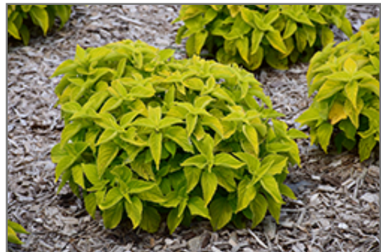
Chartres Street Coleus