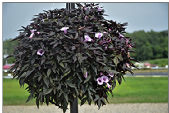
Floramia Cameo Sweet Potato Vine