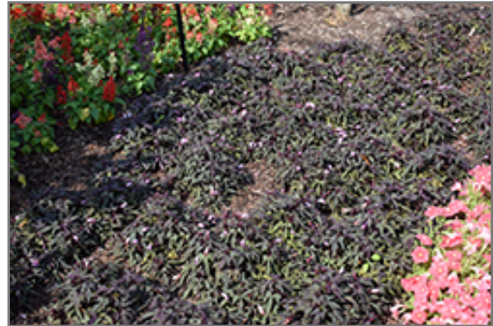
Floramia Cameo Sweet Potato Vine in bloom

Floramia Cameo Sweet Potato Vine will grow to be about 8 inches tall at maturity, with a spread of 24 inches. When grown in masses or used as a bedding plant, individual plants should be spaced approximately 20 inches apart. Its foliage tends to remain low and dense right to the ground. This fast-growing annual will normally live for one full growing season, needing replacement the following year.