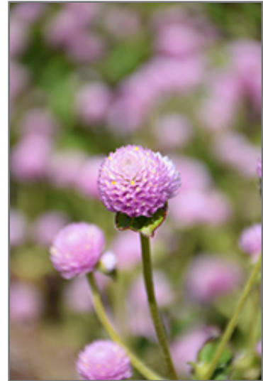
Gnome Pink Gomphrena flowers

This plant will require occasional maintenance and upkeep. Trim off the flower heads after they fade and die to encourage more blooms late into the season. It is a good choice for attracting bees and butterflies to your yard. It has no significant negative characteristics.