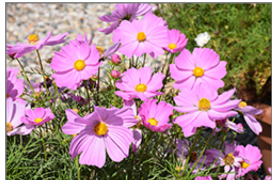
Apollo Pink Cosmos flowers